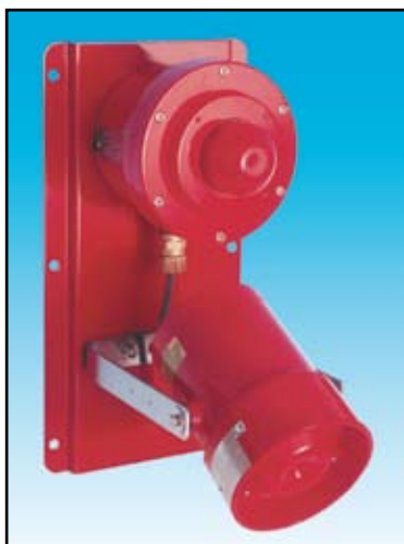
Sounder/Beacon Combination Unit