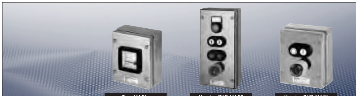
Type 414 81..