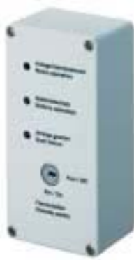
F3 remote indication