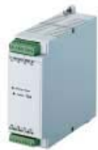
TLS staircase light switching module Plug-in module