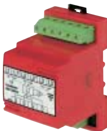
TLS switching module