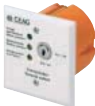
F3 remote indication flush-mounted