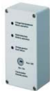
F3 remote indication