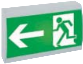
48011 with cover PL