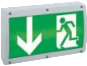
48011 IP 54 with cover PU