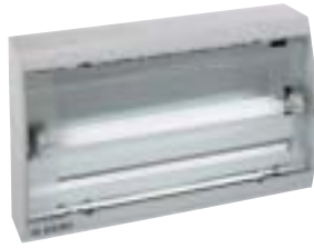
48011 with clear cover