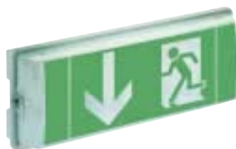
6011.1 CG-S with legend foil