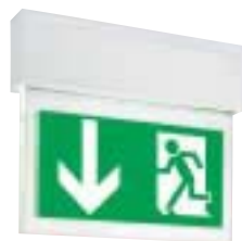
1503 LED CG-S Design white