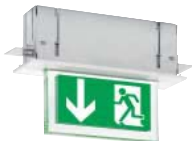
1803 LED CG-S with metal bezel white