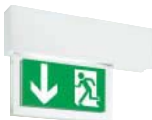
1603 LED CG-S Design white