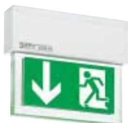
1703 LED CG-S Design white